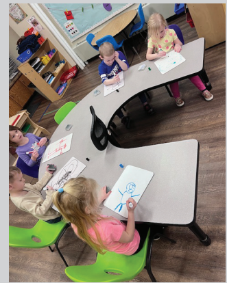
Learning how to draw people!