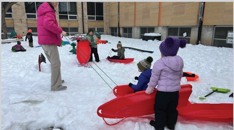
We had so much fun playing in all of the fresh snow!