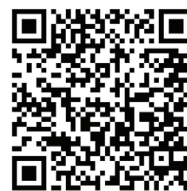
Online Giving QR Code